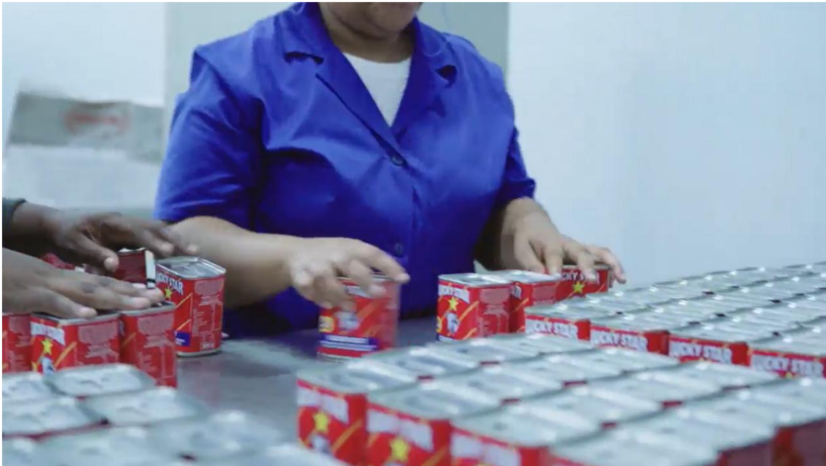
Workers working in the Lucky Star Meat Cannery

The ATESS solution reduces operational costs through improved energy efficiency, as reliance on costly grid power decreases. Additionally, by integrating advanced battery storage, the system ensures that energy usage aligns with demand, reducing wastage and further lowering expenses.