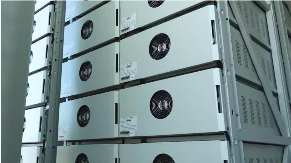
2.5 MWh ATESS battery system