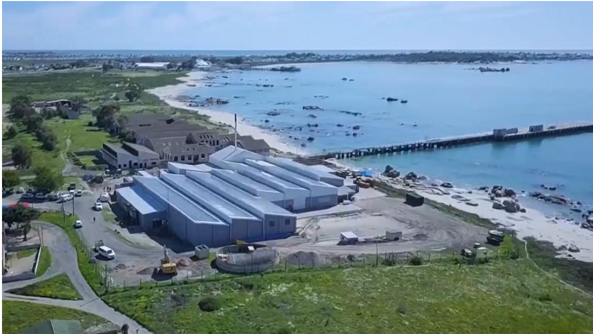
An ariel view of Lucky Star Meat Cannery with 500 KW solar panels on the rooftop