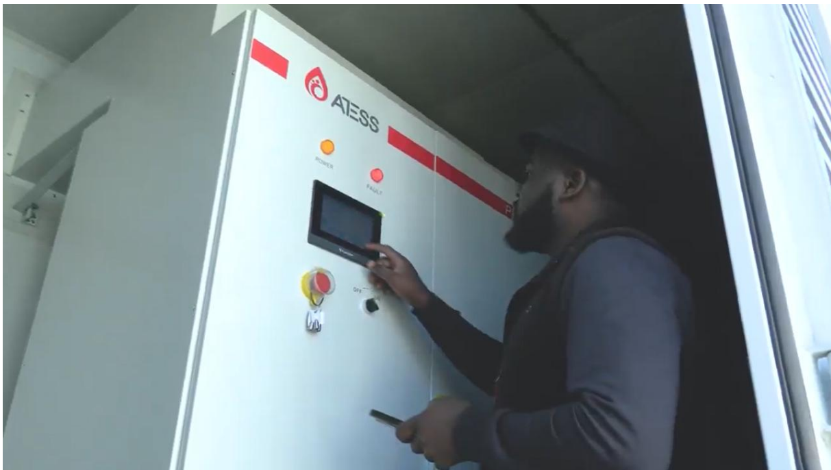
Two sets of ATESS PCS630 battery inverters

3. Inverter System: Two ATESS PCS630 inverters manage power flow and provide seamless switchover between on-grid and off-grid modes, and the switching time is 0ms. This rapid transition capability guarantees a smooth, uninterrupted power supply essential for continuous factory operations.