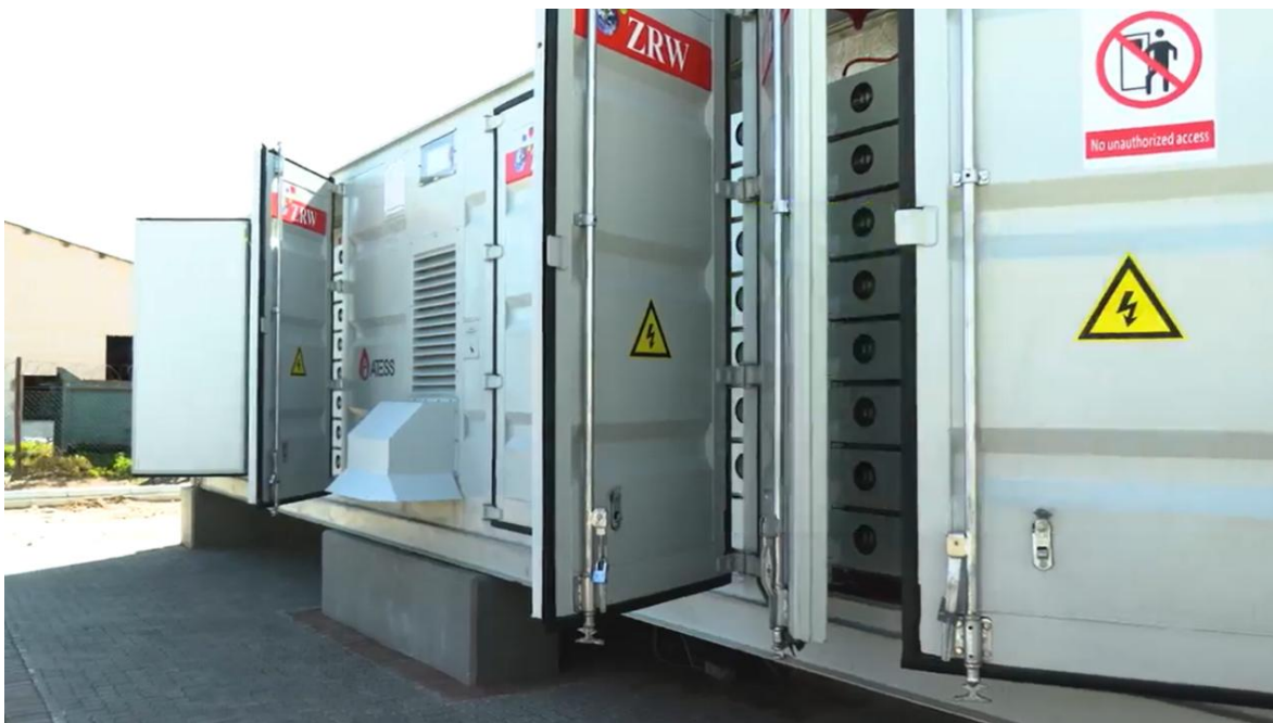
2 sets of ATESS 40HC BESS Container

Oceana Group's Lucky Star brand has been a staple for South African families since 1959, trusted for quality and rich in essential nutrients. With the construction of a new meat cannery, Oceana Group invested about 1.79 million USD in solar technology to meet its production demands sustainably. This investment is aligned with Oceana Group's commitment to responsible resource management, making the cannery operate independently of grid electricity.