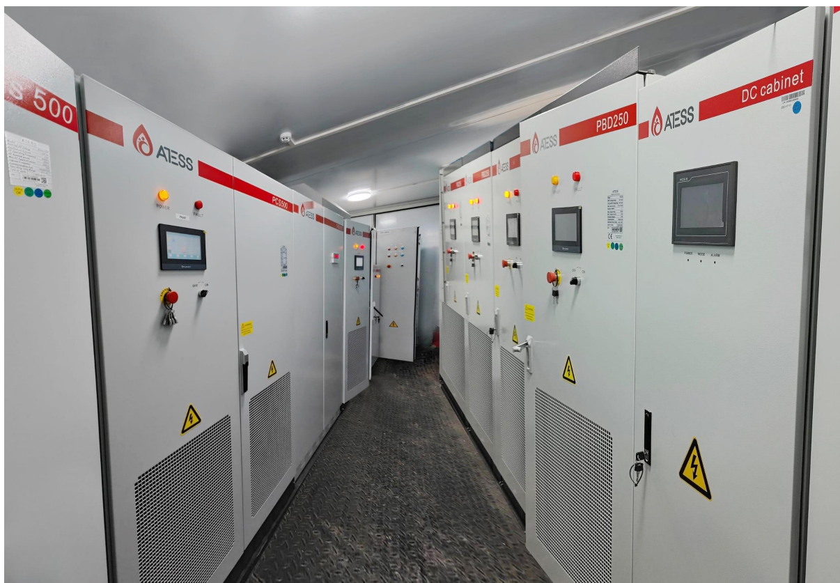
2 sets of ATESS PCS500 battery inverters and other components installed for the Saudi Arabia Project