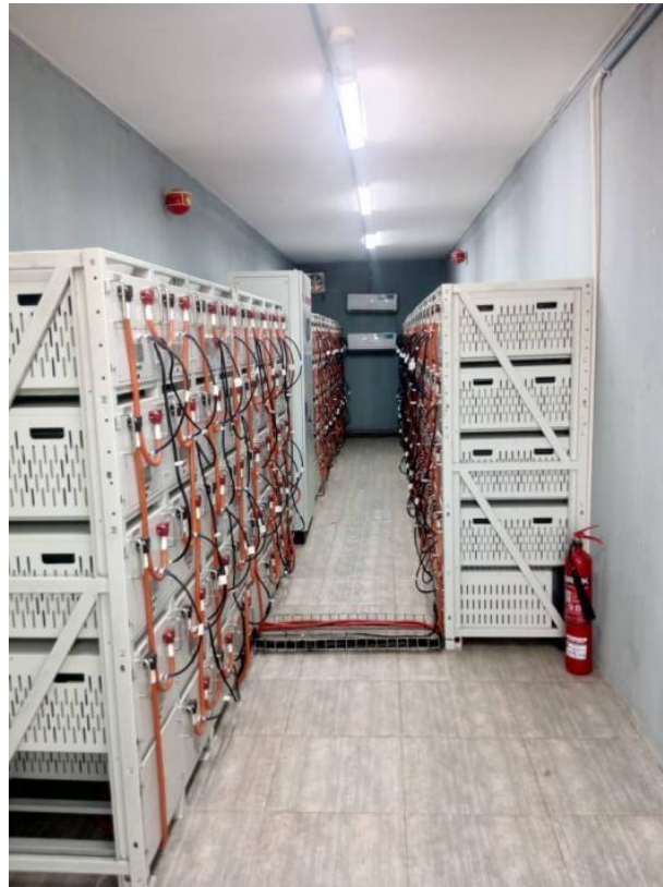
A 1.32MWh battery storage system

BR138T Battery Racks: The 10 BR138T battery racks provide modular, scalable energy storage, offering 1.38MWh capacity. Each rack supports long-term, stable energy storage with active and passive cell balancing technologies, ensuring a longer lifespan and reliable operation under demanding conditions. The self-developed 3-level Battery Management System (BMS) ensures the safety and efficiency of these racks, optimizing the battery lifespan while protecting against overcharging and excessive discharging.