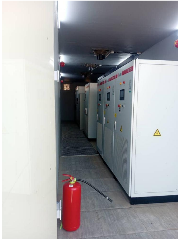
Two ATESS PCS500 battery inverters