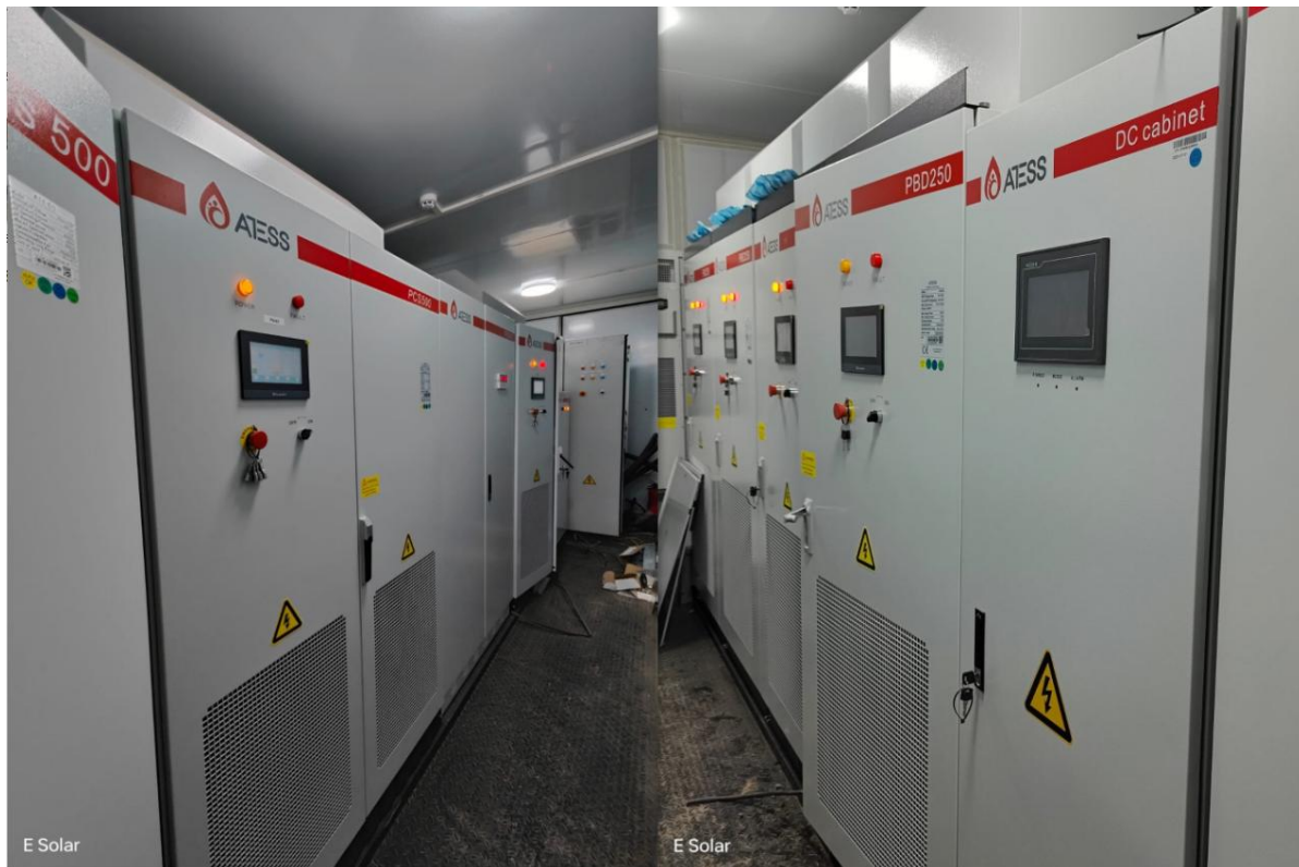
2 sets of ATESS PCS500 battery inverters and other components installed for the Saudi Arabia Project