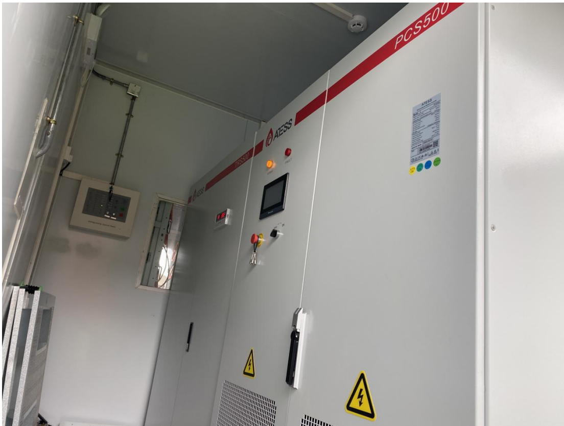
An ATESS PCS500 battery inverter inside the ATESS container

Note: It is crucial to ensure that the total load, including the EV chargers, remains between 80A and 120A. Exceeding 120A will trigger the 120A fuse. The battery is designed to supply power to only two 150kW EV chargers.