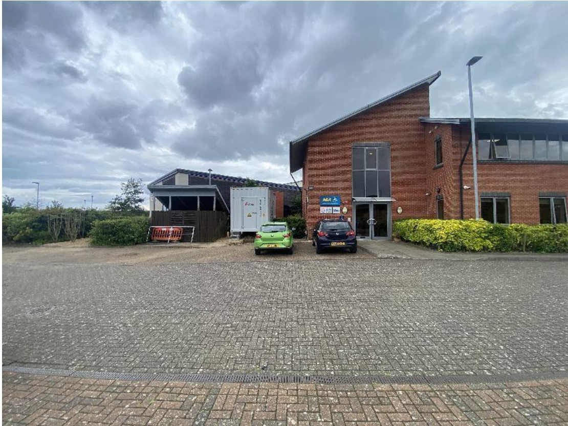
Agricultural Engineers Association (AEA) with nearby ATESS container