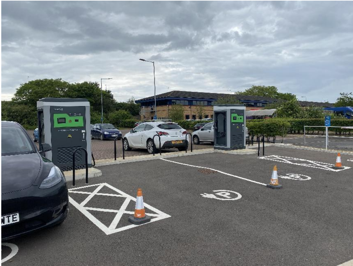
Two set of 150kW ATESS EVD-150D DC EV chargers