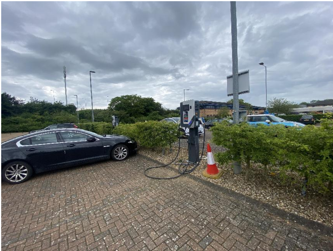
Two set of 40 kW ATESS EVD-40S/D DC EV chargers