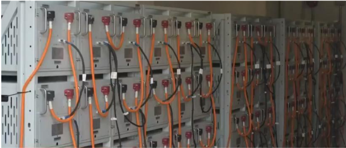
1,182.72 kWh ATESS battery system