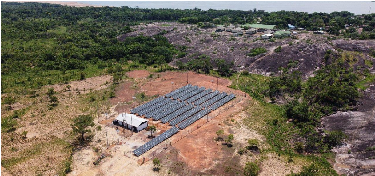
View of the Casuarito Project from above