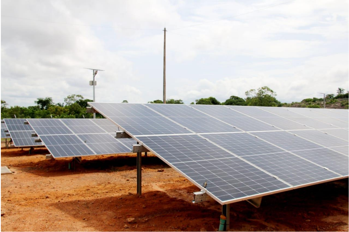
372.6 KWp PV system