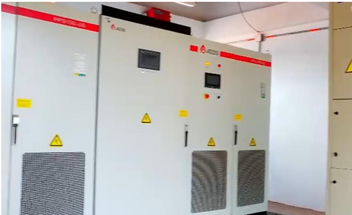
Two sets of 150kW ATESS HPS hybrid inverters

A resident in the communities shared her insights: "Indeed, as a community member, I feel immense joy and pride seeing this project come to fruition. It has significantly improved our lives, enhancing them by approximately 100%. We now have 24-hour electricity, and we hope such projects continue to expand and further develop Casuarito Vichada."